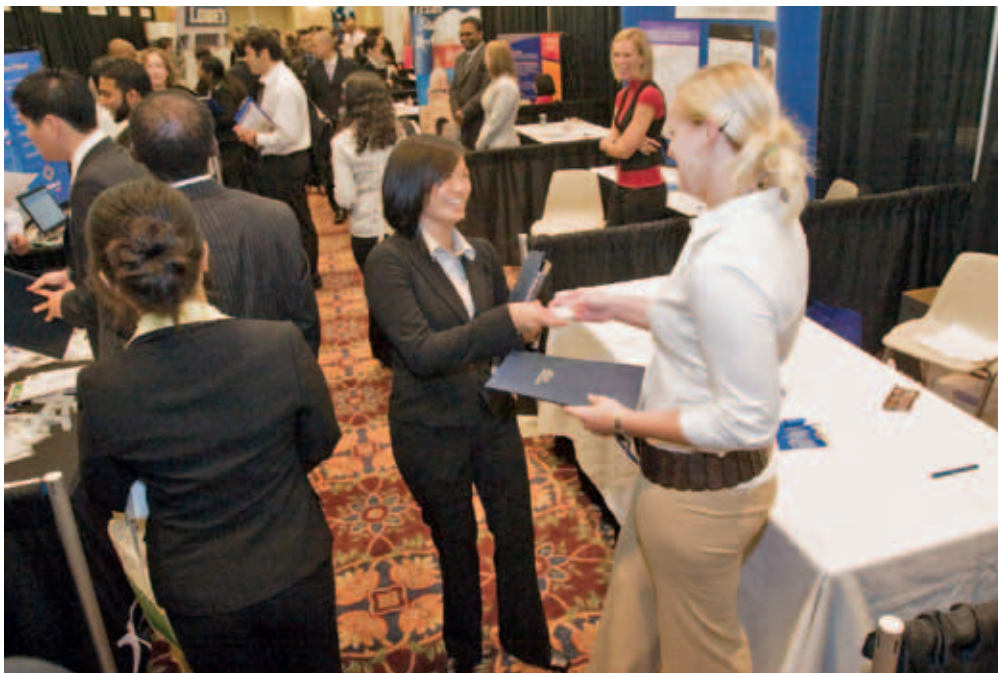
Over 2,000 students attended the Fall 2008 Career Fair held by Rockwell Career Center.

Thousands of UH Bauer College students looking for internships and preparing for the job market after graduation met with more than 150 recruiters from the area's leading businesses at the Fall 2008 Career Fair hosted by Rockwell Career Center.