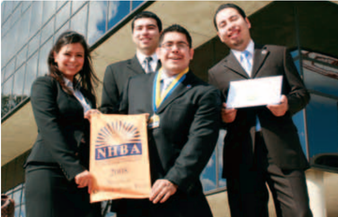
Officers from the Hispanic Business Student Association celebrate after being named Chapter of the Year at the annual National Hispanic Business Association Leadership Conference for the first time since 2002.

The thriving University of Houston chapter of the Hispanic Business Student Association at UH Bauer College of Business was named Chapter of the Year at the annual National Hispanic Business Association Leadership Conference for the first time since 2002. HBSA at Bauer topped chapters from 45 other colleges, including University of Texas at Austin and Texas A&M.