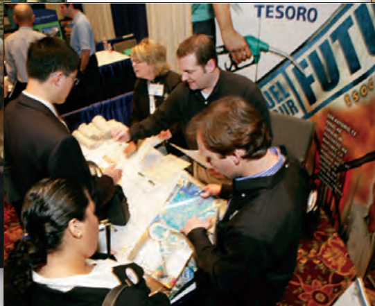
Tesoro recruiters and Bauer students seek a match.